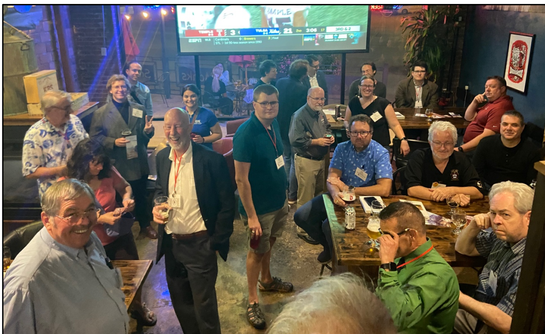
SMH members and guests gather at Monk's House of Ale Repute for meaningful discussions about military history.