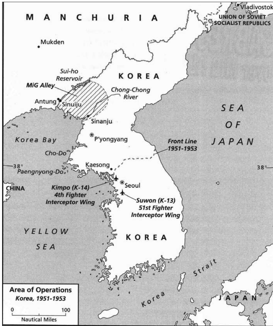
Example of long view